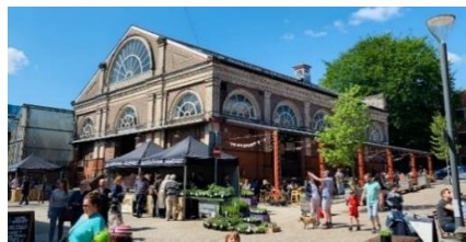
Altrincham Town Centre Altrincham Market Hall

Let us hope that most businesses are able to reopen when they are allowed to by the easing of restrictions.