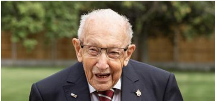
Captain Sir Tom Moore

Member of Parliament for Altrincham and Sale West